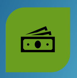
PASSED IN 2014 AND PROVIDED $ 240 MILLION FOR CAPITAL PROJECTS