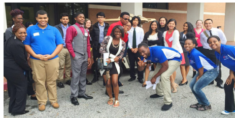
Clayton State University Student Ambassadors with WBL students before a guided tour of the campus.

The Work-Based Learning (WBL) Success Seminar is held annually and was hosted for the second consecutive year by Clayton State University. 200 students and school representatives attended from ten Clayton County high schools. The seminar provided students an opportunity to gain real world, real work experience. The Success Seminar included a general session and eight different workshops facilitated by industry professionals. Workshops focused on teaching soft skills to students to be successful in the workforce, as well as introduce career options. The afternoon concluded with Clayton State University student ambassadors taking Clayton County Public Schools WBL students on a brief campus tour including classrooms, student housing, student center and the athletic center.