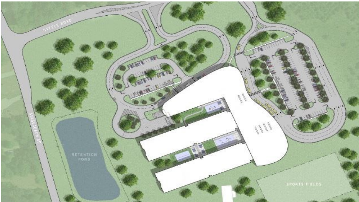
East Clayton Elementary Site Plan